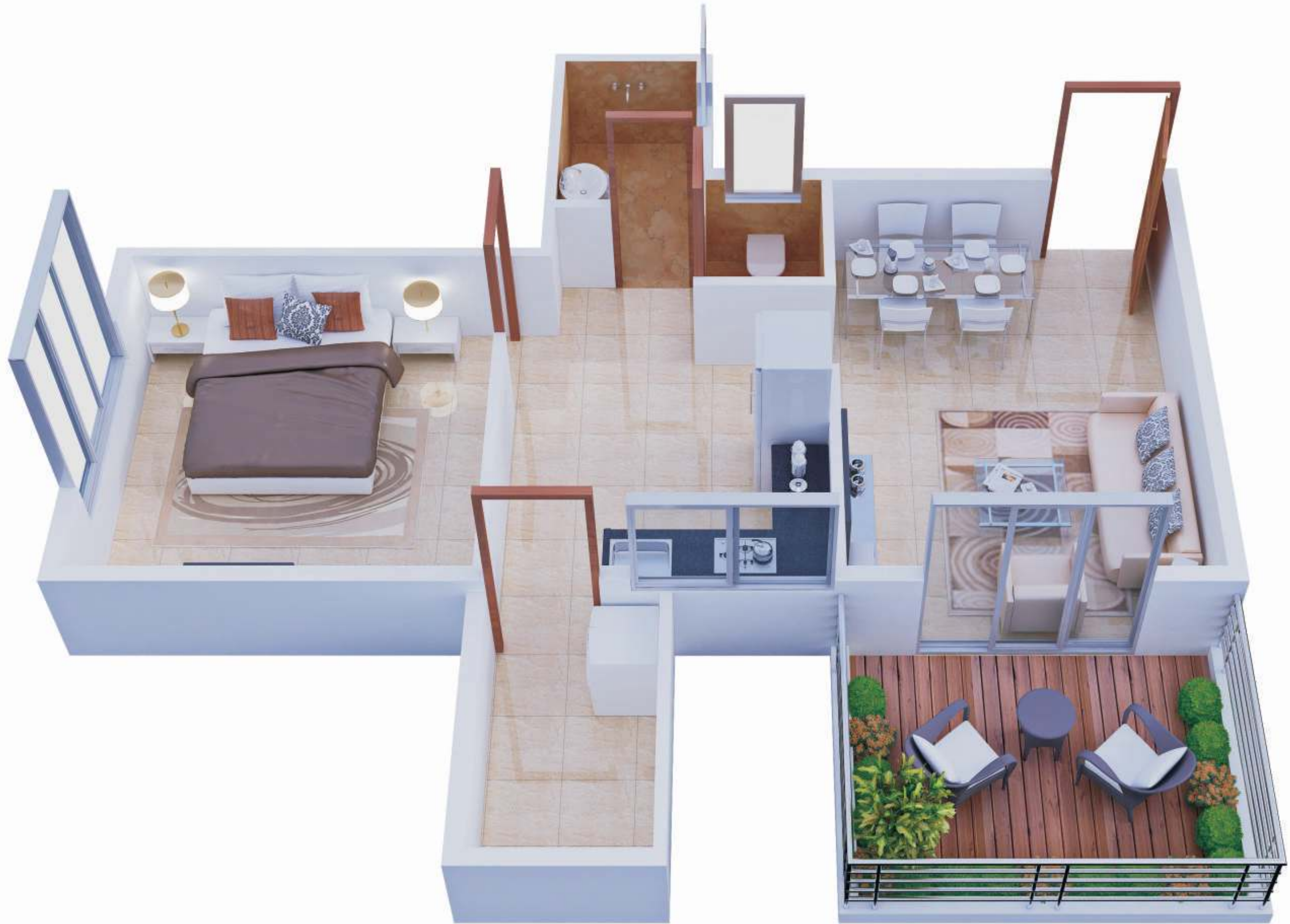
| 1 BHK